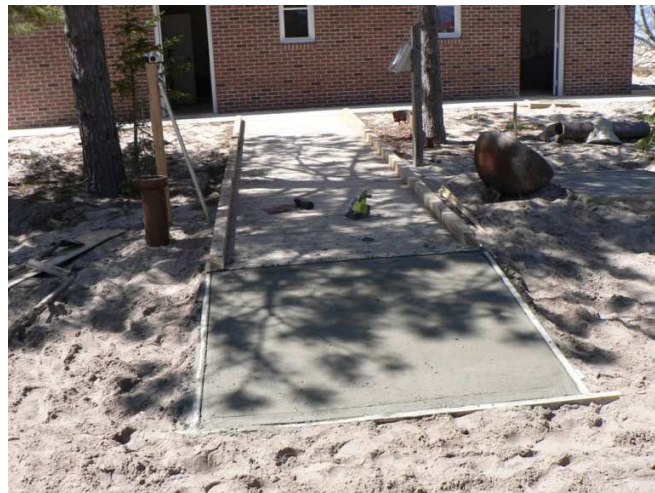
The ramp to the visitor center.

A lot of work was accomplished out at the light in the last week of April. Volunteer keepers have had trouble in the past with their campers getting stuck in the sand. That will not be a problem anymore! A new concrete pad was poured, specifically for the volunteer keepers to park their campers. At the same time, a concrete pad was added for the buoy weight (see page 7), and the ramp to the visitor center was extended to make it easier for visitors with wheelchairs. Stan Klein, Chuck Nearhood and Rick Brockway did the concrete work.