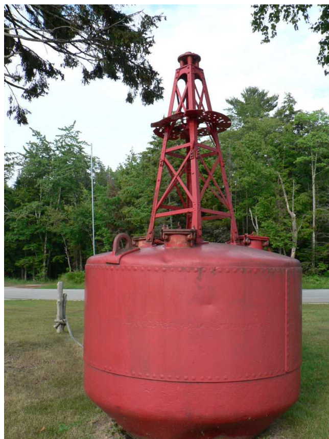
This is the type of buoy that would have been anchored by the buoy weight.

There is now a small concrete pad that will hold the buoy weight, next to the ramp to the visitor center. As the weight is now laying upside down, the next challenge is to lift it and place it on the concrete.