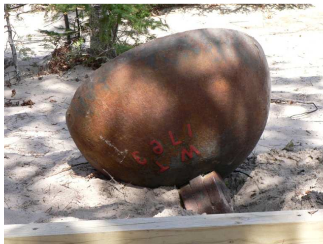
The weight as it currently sits.

Rick Brockway took the weight out to the light and removed it from the trailer by chaining it to a tree and driving away.