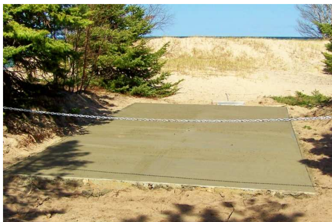
The finished parking spot.