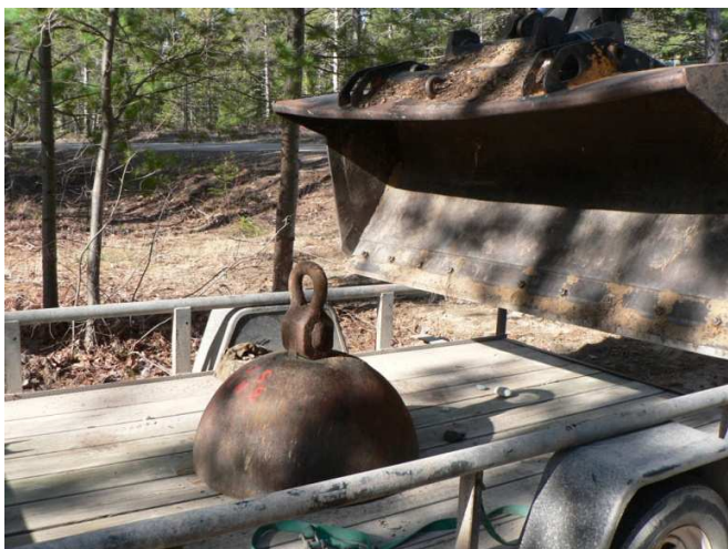
On the trailer.

Rick Brockway took the weight out to the light and removed it from the trailer by chaining it to a tree and driving away.