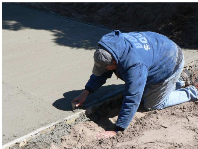
Chuck Nearhood working on the camper parking pad.

As you know, if you have visited the tower, the first step up to the service building is very tall. The boardwalk is being adjusted so that the step will be a normal height.